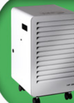
HP 25 Funk