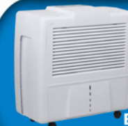
B 280 Funk (alternative B 500 Funk)

COMBINATION OF HUMIDIFIER & DEHUMIDIFIER